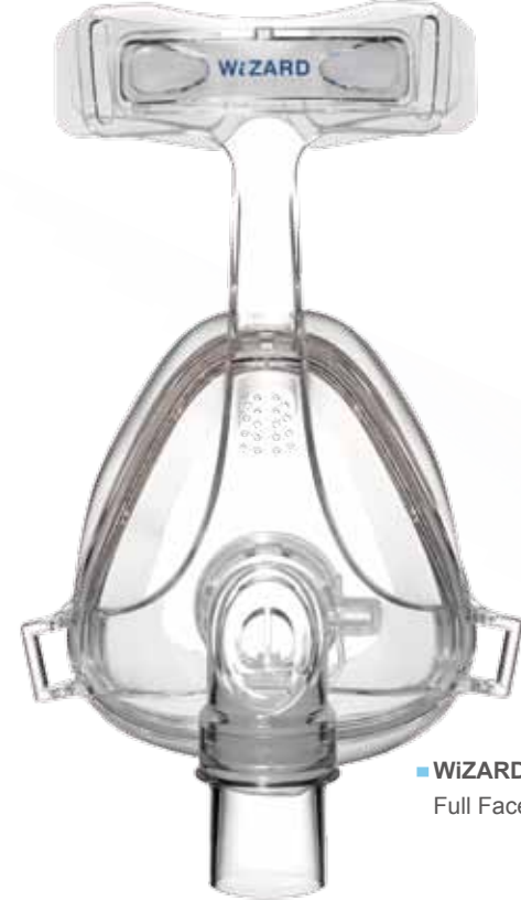
■ WiZARD 220 Full Face Mask