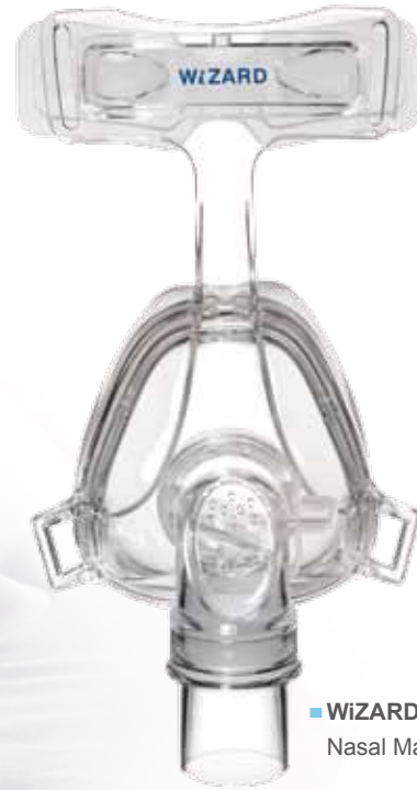
■ WiZARD 210 Nasal Mask