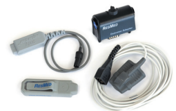
S9 complete oximetry kit 2 369100