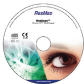
ResScan™ patient management software Contact ResMed for product ordering information.