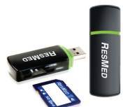
SD card reader 36931 • USB extension cable 7071015