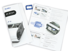
SD card protective folder • 36840 (10 pack, including SD Card) • 36845 (10 pack, folder only)