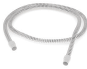
Standard tubing • 6'6" replacement standard tubing 14987