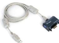
S9 USB adapter 36950