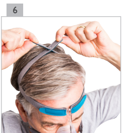
Position the headgear on the head so that the lower portion does not hit the ear lobes.