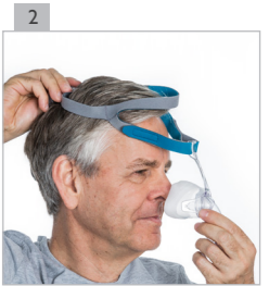
Pull the headgear over your head.