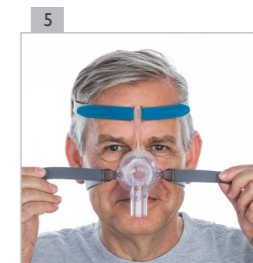
Adjust the lower portion of the headgear the same way so that it is as loose as possible and as tight as necessary.