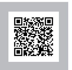
You'll find our user video on YouTube.