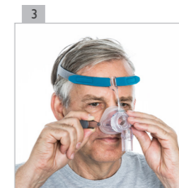
Fasten the lower clips on the mask.