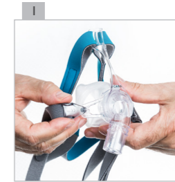
Loosen both clips from the mask.