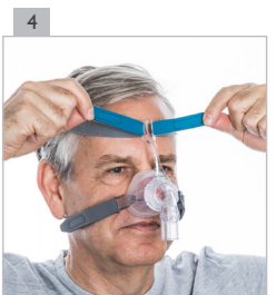
Adjust the upper portion of the headgear so that it is as loose as possible and as tight as necessary.