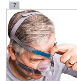
Adjust the forehead support as loosely as possible; it does not have to lie on the forehead.